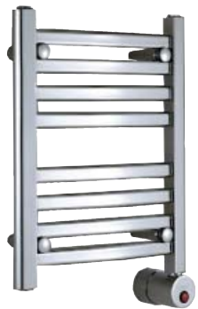
Diagram for illustrative purposes only